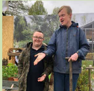
Gerard Binks kindly took the photos for the backdrop.