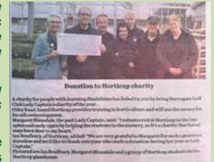
Donation to Horticap charity

I also used to help the students to make hanging baskets and in the run up to Christmas we made lots of Christmas wreaths."