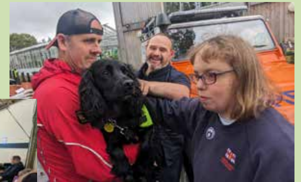
Funding for this wonderful and valuable organisation is totally reliant on donations and fundraising. www.uwfra.org.uk