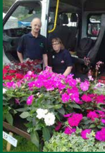
We were delighted to be a part of these events again in 2019...

The Fewston Walk in August was organised by the Fewston Ladies, and after an evening walk taking in some amazing views around Fewston Reservoir, we tucked into delicious sandwiches and cakes. A big thank you once again to all the ladies at Fewston for another