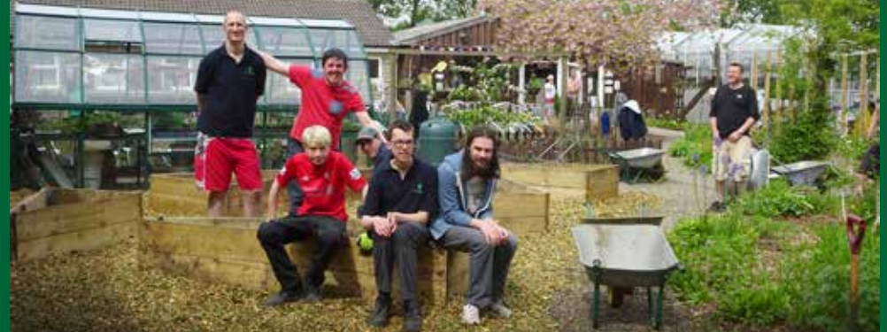
MAY... The team were out in the Horticap garden building new raised beds. These are now ready to be planted and look brilliant. Fantastic work!